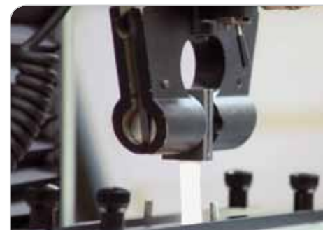
Rigorously tested, DuraPrint provides maximum durability and scanability.

“DuraPrint was a perfect match for everything we were looking for in a new patient wristband,” said Victoria. “In the end, it was easy for our hospital to make the move to DuraPrint. The product is a big part of the success we’ve achieved in the implementation of all our patient safety initiatives.”