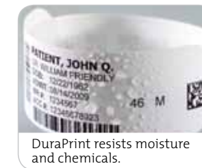
DuraPrint resists moisture and chemicals.