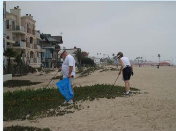
PDC Volunteers at Heal the Bay's Nothin' But Sand Beach Cleanup