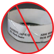
wrinkles & folds that obstruct scanning

Traditional laminate overlay wristbands may cause wrinkles and folds, which can obstruct bar code scanning and can also cause water and chemicals to become trapped underneath the laminate overlay.