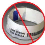
water or chemicals trapped below overlay

DuraPrint's patented design with advanced material protects patient data and bar codes without the need for a laminate overlay, which saves hospital staff time and increases work flow efficiency.