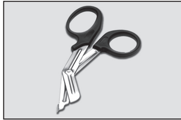
699 Safety Scissors $7.50 each